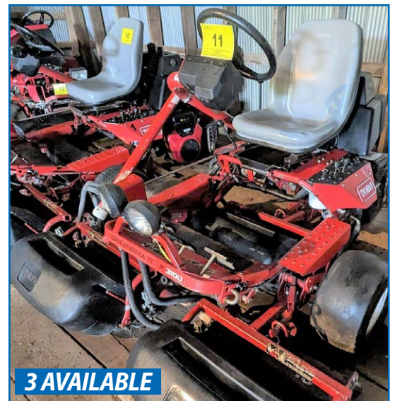
TORO GREENMASTER 3100 REEL MOWER