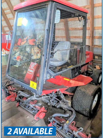
TORO REELMASTER 5400-D REEL MOWER