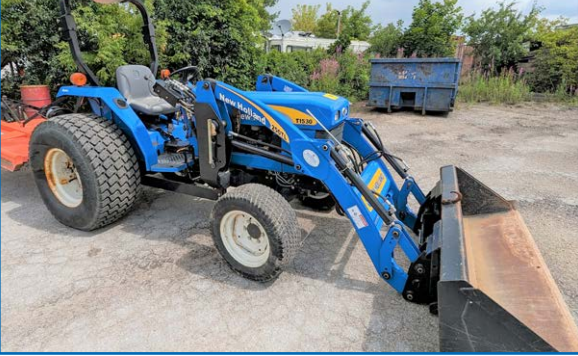
TOWABLE POWER SPRAY UNIT NEW HOLLAND TRACTOR

2017 NEW HOLLAND L225 Skid Steer Loader, Hyd Q/C, Aux Hydraulics, Joystick Controls, Enclosed Cab, w/ Bucket, Approx. 492hrs, s/n NEM474014, PIN JAF0L225AEM474014